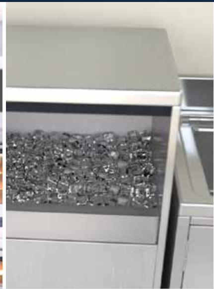
Ice makers and cooling systems