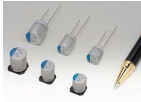
100V conductive polymer aluminum solid electrolytic capacitors—the chip-type “CV series” (bottom), and the radial lead-type “LV series”