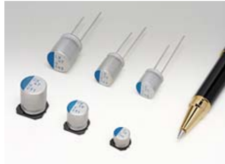
Products that guarantee 3,000 hours at 125°C the chip-type “CX series” (bottom), and the radial lead-type “LX series”

Table 1 also shows the difference when comparing the pyrolysis temperature between the two. In light of environmental issues in recent years, lead-free solders have been introduced, and electronic components are becoming exposed to higher temperatures during the soldering process. As such, there is now a demand for greater resistance to high temperatures for the electronic components. In particular, in the reflow soldering process that involves connecting the electronic components to the circuit board using molten solder, the board that the electronic component is set on must be exposed to temperatures higher than 250°C. Therefore, the electronic component is also exposed to greater heat stress as compared to an implementation that makes use of lead solder. For that reason, conductive polymers with a high level of heat stability, such as PPy (polypyrrole) and