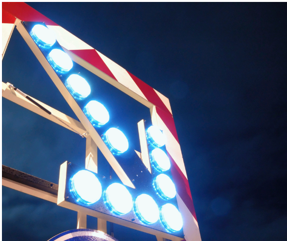
High Power LEDs are used in a number of sign applications, including exit lighting, construction signs, emergency lighting, and billboards.

For example, the EU member nations - Japan, Australia, Brazil, and Canada -- will be enforcing bans on incandescent bulbs by 2012. Design engineers in medical device, sign, consumer electronic, appliance, decorative, security, and other lighting applications are also increasingly integrating high-power (1-watt capacity or higher) LEDs in the development of new products.