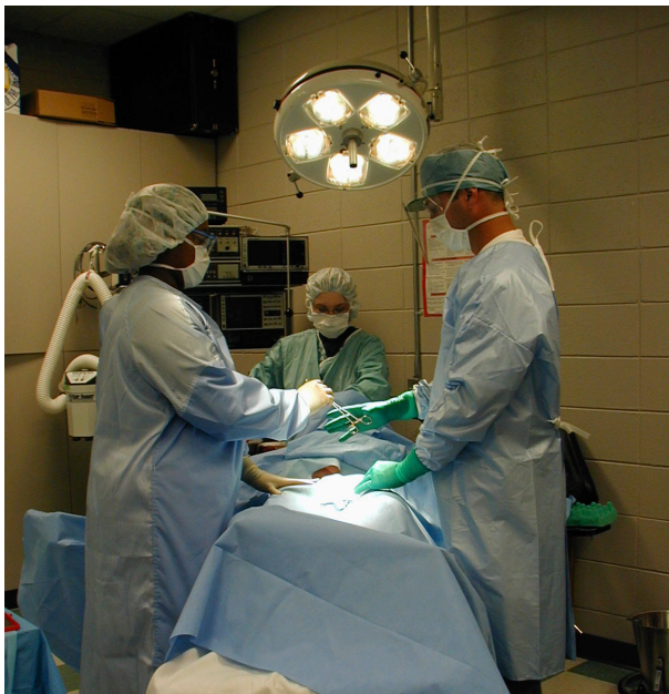
Medical device applications for high power LEDs include surgical lighting, sensor systems, diagnostic equipment, small tool instruments, and digital scales and monitors.

The use of RGB LED technologies such as the AstraLED and TitanBrite can result in up to a 30% cost savings, as well as 67% real estate package savings when compared to the use of individual high power red, green, and blue packages. The use of a single RGB package also enhances production efficiencies as a single part number eliminates the need for three separate LED part numbers.