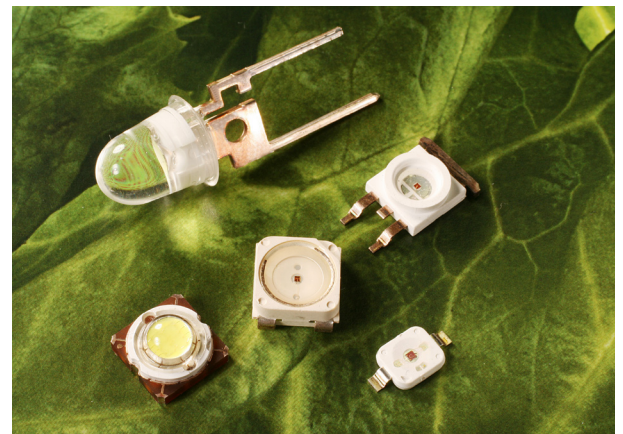
A number of new high-power LED technologies on the market combine energy efficiency and quality light performance.

lenging economy? The answer is two-fold; today's high-power LEDs provide enhanced efficiency and better light.